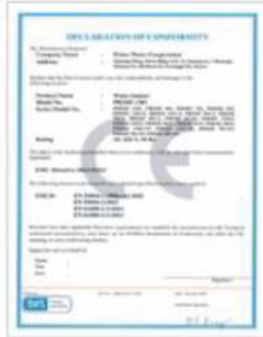
CE - LVD