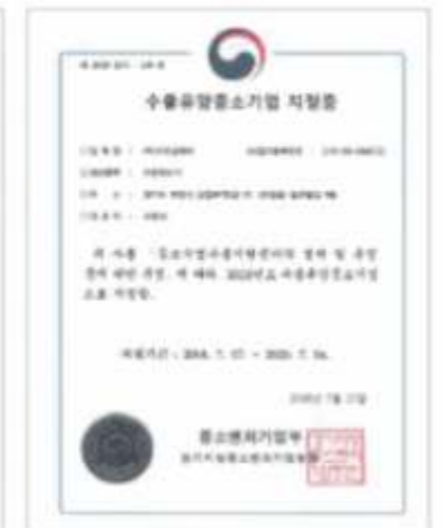
Promising Export Enterprise(KOR)