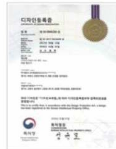
Design Patent-R series