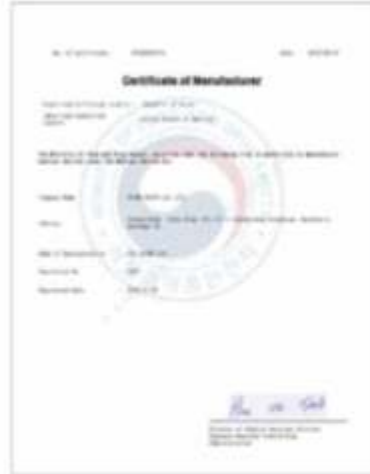
Medical Device Manufacturer