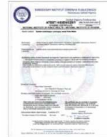
POLAND ATEEST HIGIENICZNY

★ Our Imported products have many necessary certificates , which are required by the department