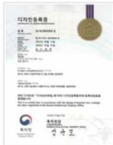
Design Patent-R series