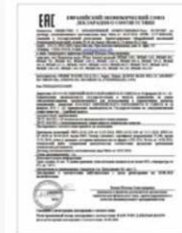
EAC Russia Certificates