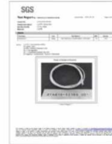
SGS BPA FREE