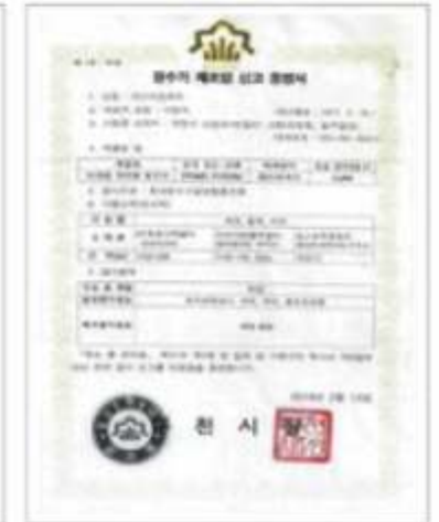
Water Purifier Manufacturer