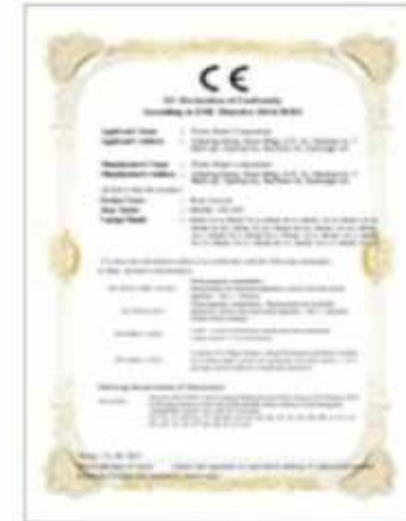
CE - EMC