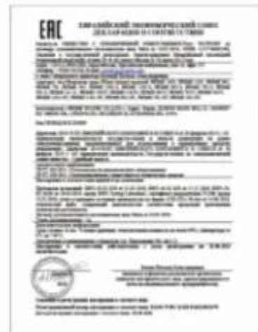
EAC Russia Certificates

★ Our Imported products have many necessary certificates , which are required by the department