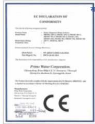
CE - EMC