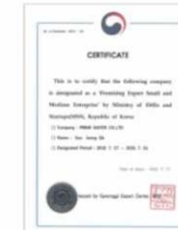
Promising Export Enterprise