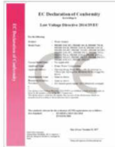
CE - LVD